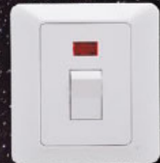
20 Amp DP Switch