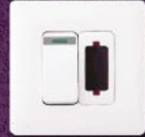
20 Amp Heavy Switch