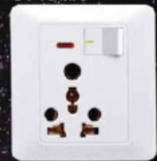
1 gang + (5/16 A + MF) Multi Power Socket with Indicator