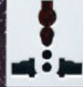
MF Socket Knob