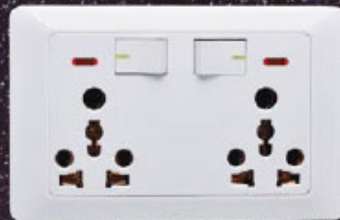
2 gang + Double (16 A + MF) Multi Power Socket with Indicator