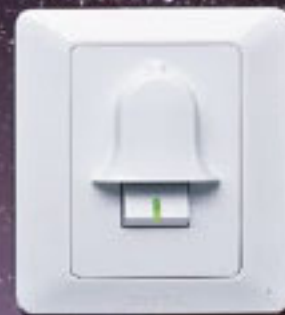
1 gang Water proof Bell push switch