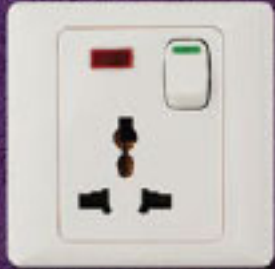
13 Amp Switch + Socket