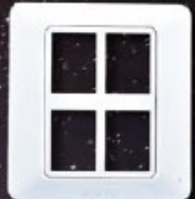
4 Gang switch plate without Knob