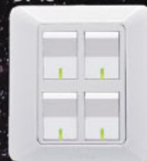
4 gang 1 way