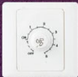
Fan Speed Adjusting Switch