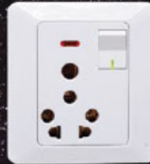
1 gang + 5/16 Power Socket with Indicator