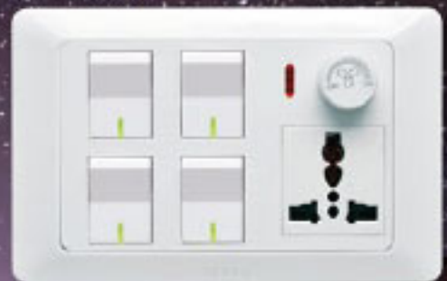
4 Gang Switch + Socket, Indicator & Fan Dimmer