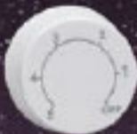
Fan Dimmer Knob