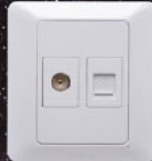
TV + Telephone Socket