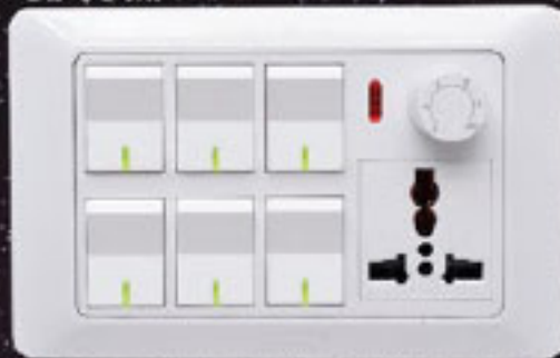
6 Gang Switch + Socket, Indicator & Fan Dimmer