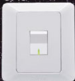
1 gang 1 way