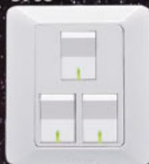
3 gang 1 way