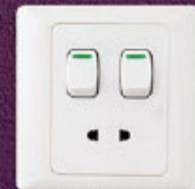
2 Gang Switch + 2 pin Socket