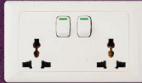
13 Amp Double Switch + Socket