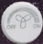
Light Dimmer Knob