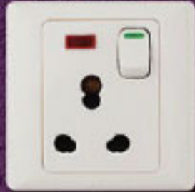
5/16 Amp Switch + Socket