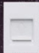
Telephone Socket Knob