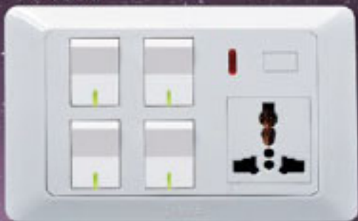
4 Gang Switch + Socket & Indicator (Dimmer Provision)