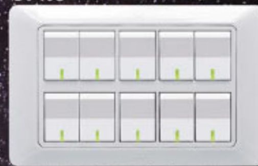
10 gang 1 way