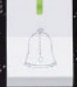
Bell push Switch Knob