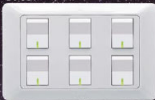
6 gang 1 way