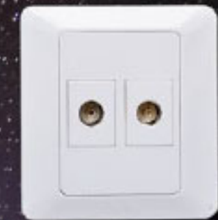
Double TV Socket