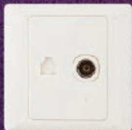
Telephone + TV Socket