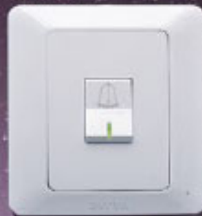
1 gang Bell push switch