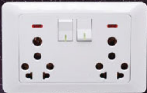
2 gang + Double (5/16) Power Socket with Indicator