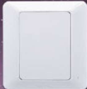
3x3 Blank Plate