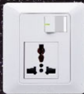
1 gang + MF Socket