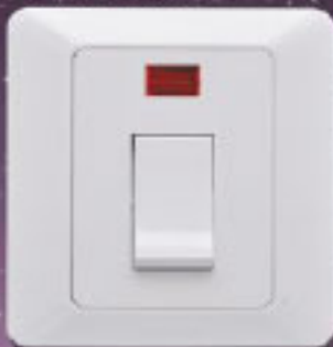
45 Amp DP Switch