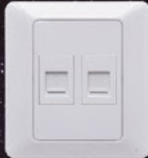
Double Telephone Socket