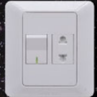
1 gang with 2 pin Socket