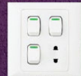
3 Gang Switch + 2 pin Socket