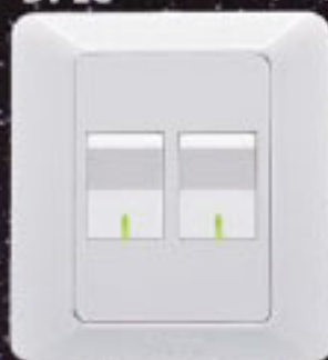
2 gang 1 way