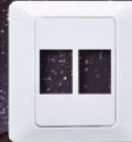
2 Gang switch plate without Knob