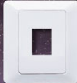
1 Gang switch plate without Knob